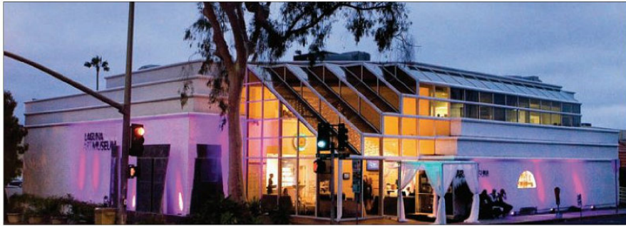
Laguna Art Museum